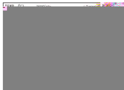
Wave Soldering (Flow Soldering)