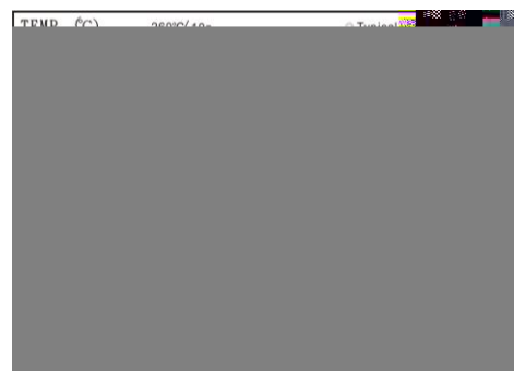
Wave Soldering (Flow Soldering)